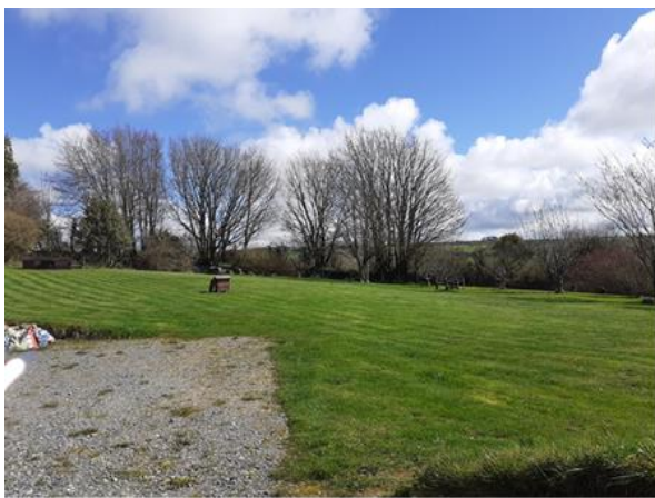
From driveway looking east