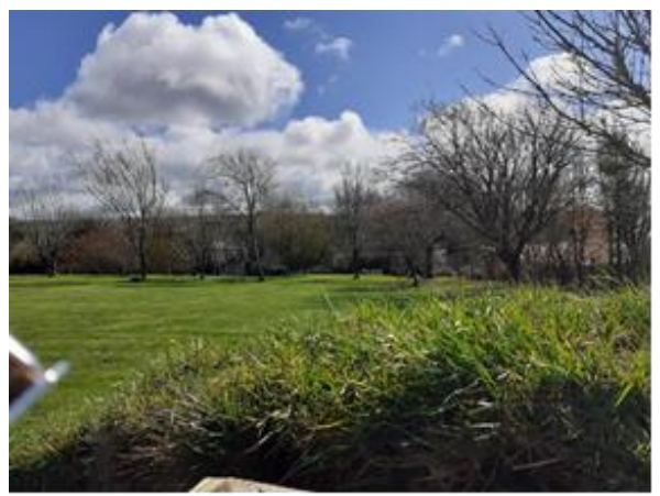
Site from the highway

The site is located part of the cluster of development at Patchole made up of a selection of dwellings centred around the road junction. The site is accessed from an unclassified road, with the land at a higher level from the road and enclosed by established hedgerows. The site appears to have been used for recreational purposes with a summer house and formal planting having taken place on site.