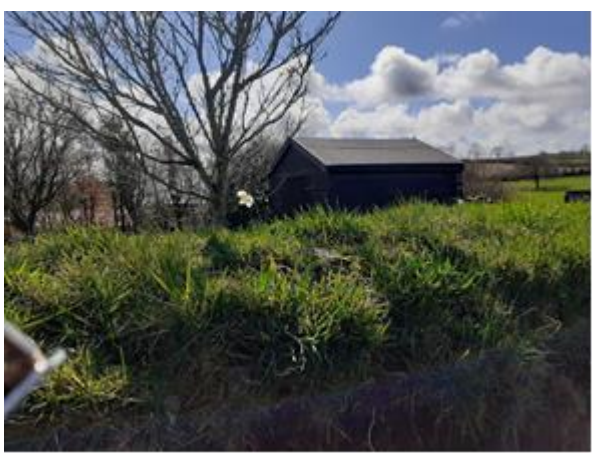
Existing shed on site