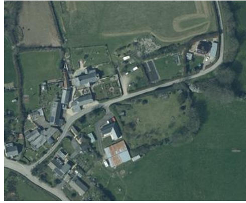
Proposed dwelling.....Aerial View of Site